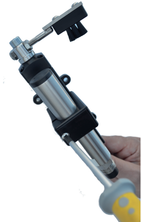
Horizontal Brush - Adjust clamp