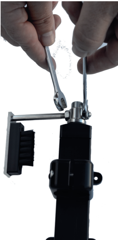
Vertical Brush - Adjust arm

The amount of brush pressure can easily be adjusted by sliding the sensor upwards or downwards in the clamp. Do this by loosening the clamp screw and tightening again once you have made the desired adjustment.